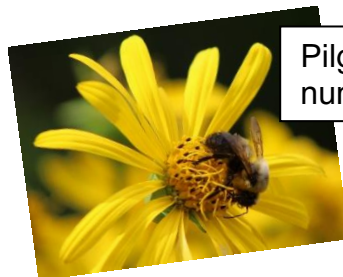
Pilgrim Heights welcomes growing numbers of bees...

And gratitude galore goes to volunteers of all sorts – church work groups, board members, gardeners, mowers, tree trimmers, waterfront keepers, weeders, cleaners, and visitors who live by the words 'leave a place better than when you arrived.'