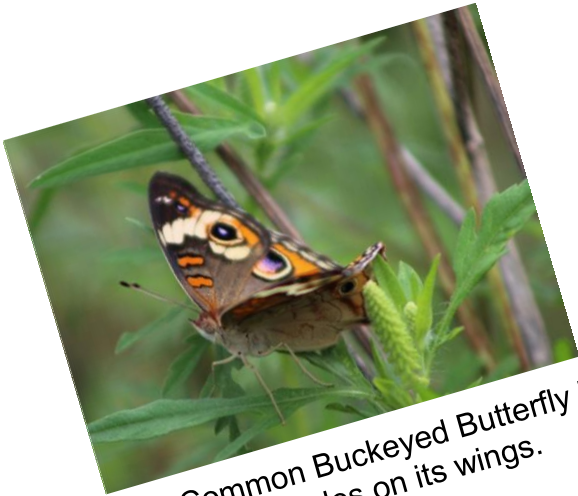
The Common Buckeyed Butterfly has dot circles on its wings.