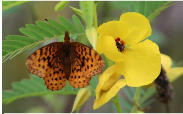
Orange wings with scattered markings help identify the Meadow Fritillary butterfly.